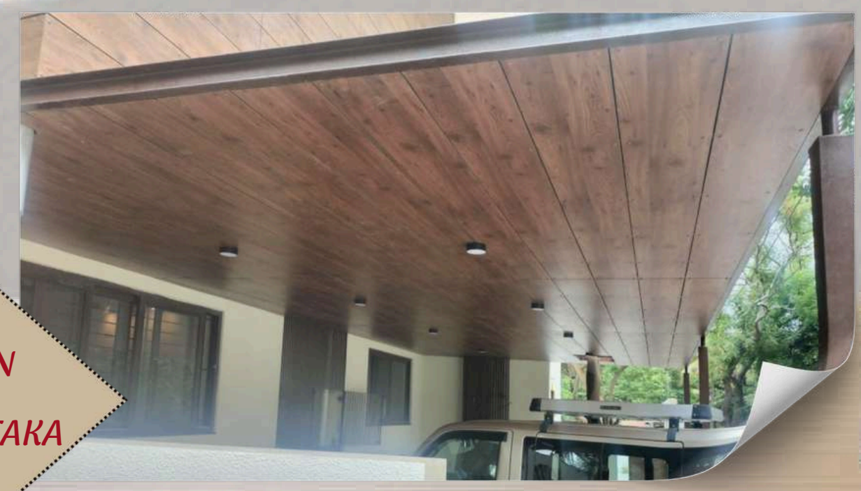
PROJECT : HOME ELEVATION ADD : BANGALORE, KARNATAKA